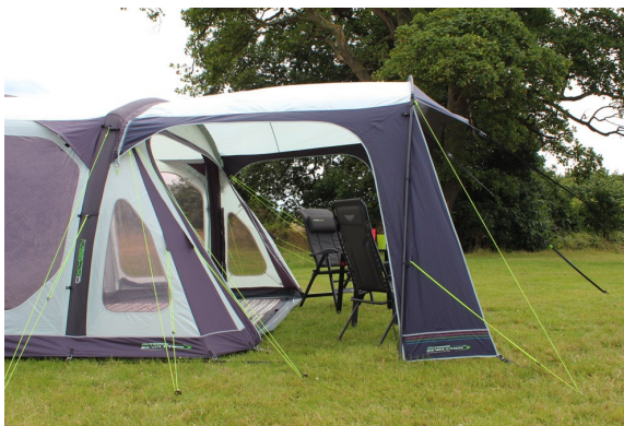
OZONE 6.0 Canopy